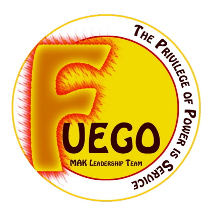
Fuego. Fuego's name is emblematic of the Fire of Passion the members bring to the

school and are empowered to bring to our students. Membership in Fuego is BY INVITATION ONLY and is generally limited to older Karate Kids, Black Belt Karate Kids, and Teens. There is no procedural justice offered for membership selection on either FIST or FUEGO, and the management team makes the only team member selections available. This attitude toward membership